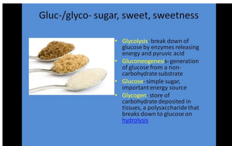
Figure2. Screen shot of an example of a root derivative with pictorial representation and Health Science contextual description