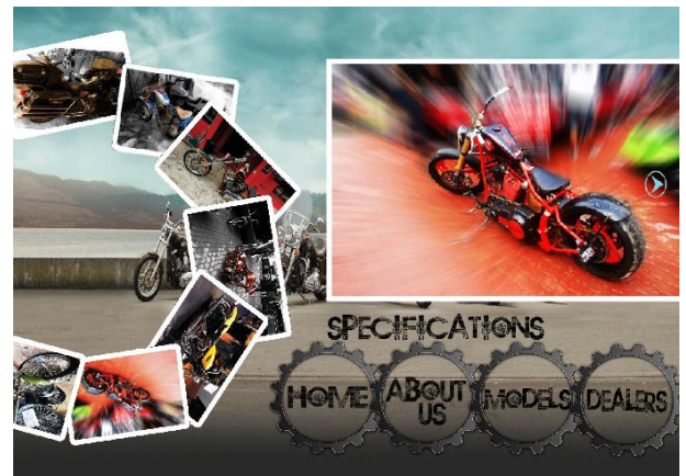
Figure 2: Discussion and sharing of work progress among the members in Facebook project group (left), and the screenshots of their final work (right)