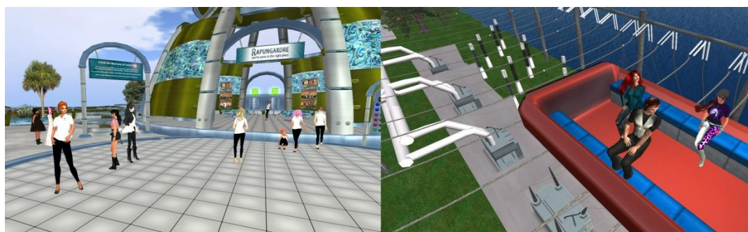
Figure 4: Health students preparing for their interviews (left) & engineering students touring the Areva NuclearPower Plant

Although 20 students actively participated in the VWC, only four students in Semester 2, 2012 and three students in Semester 1, 2013 were regular attenders. These students were asked to reflect on the experience of attending the club and whether they had benefitted in terms of the work they were doing on their projects. Students completed a Blackboard Survey which consisted of eight Likert scale questions, phrased both positively and negatively (the scale consisted of Strongly Agree, Agree, Partially Agree, Partially Disagree, Disagree, and Strongly Disagree). The data was automatically summarised by Blackboard and student comments remained anonymous.