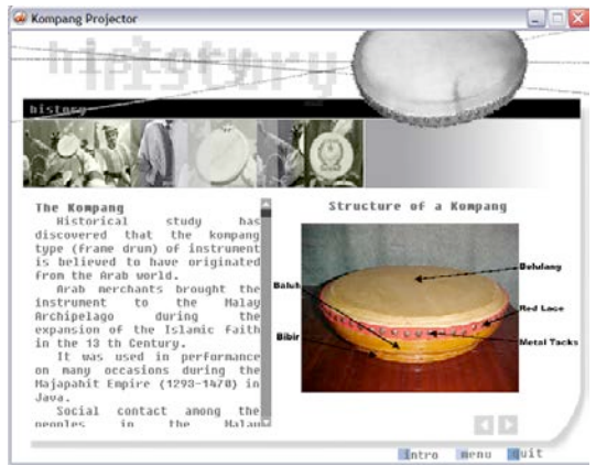
Figure 10: Project snapshot for T3