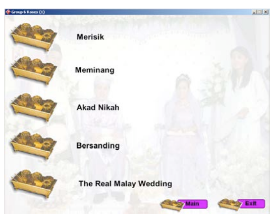
Figure 7: Project snapshot for T6

The project outcome for T9 and T3 were full of local, cultural, colourful and informative content.