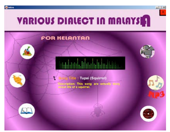
Figure 13: Project snapshot for T11