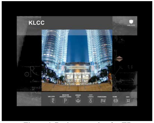
Figure 6: Project snapshot for T7