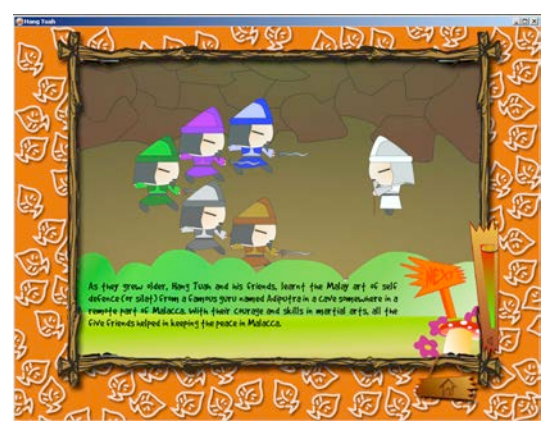
Figure 4: Project snapshot for T1