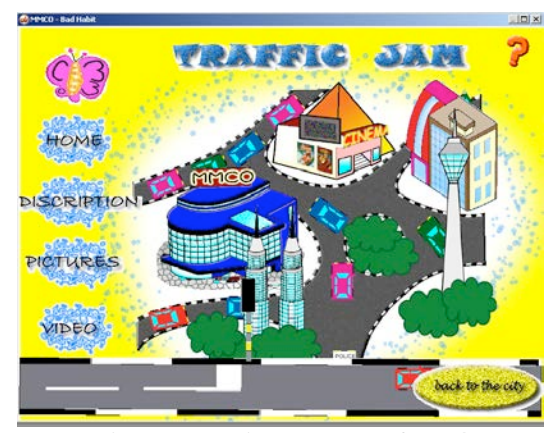
Figure 5: Project snapshot for T4