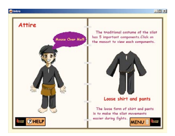
Figure 8: Project snapshot for T5