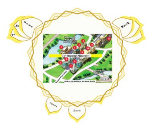
Figure 12: Project snapshot for T2

The final product of T2 was assessed as meagre in quality. The team's goal was not achieved as planned, and theories learnt were not fully utilized. Application constantly returned with errors and takes up a lot of time for loading.