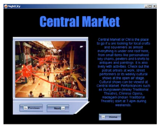
Figure 11: Project snapshot for T10

The resulting product outcome for T10 has showed poor design application and barely maximizes the usage of multimedia tools.