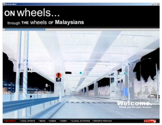
Figure 3: Project snapshot for T8