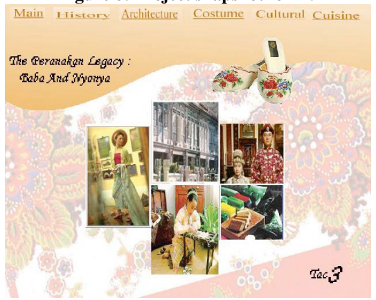
Figure 9: Project snapshot for T9