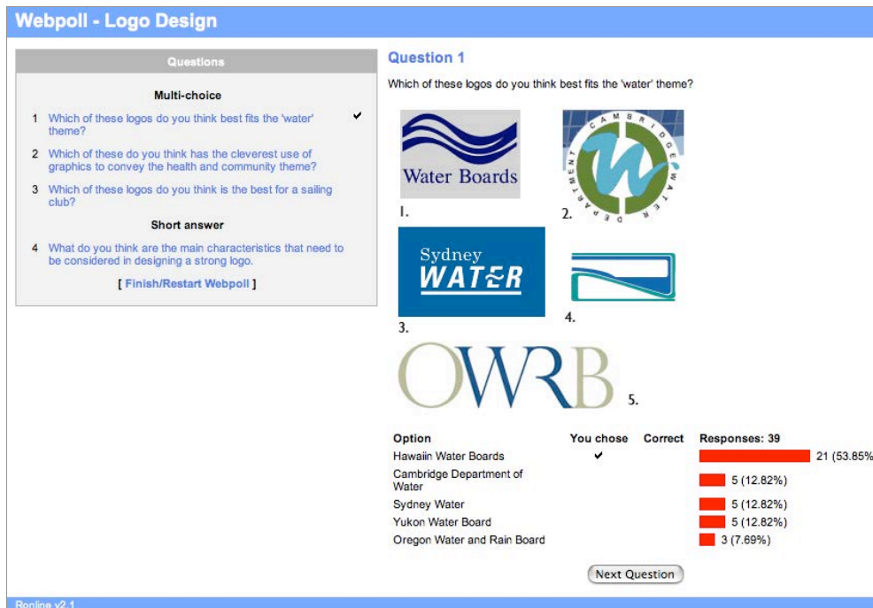
Figure 2: A Web-based audience response activity

Audience response systems have been used at Edith Cowan University in large classes for several years. In the large first year unit, Communications and Digital Technology, use of the system provides many learning opportunities. In lecture settings where the presentation of concepts and ideas is through teacher presentation, the audience response system provides the means to create interactive sessions. Questions are displayed requiring student feedback. Groups of students use a single clicker to discuss and respond. The teacher presentation can then take into consideration the responses and high degrees of interactivity are achieved.