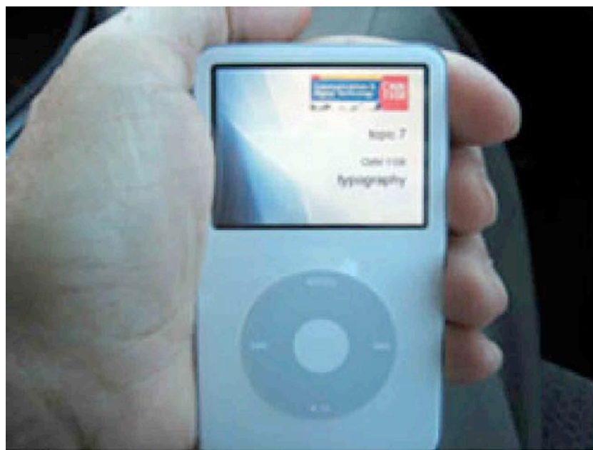
Figure 3: A vodcast of a lecture being accessed on a portable mp3 player

It is quite common in large classes for lectures to be videotaped and stored on unit Websites to enable students to access the lectures after they have been delivered. Students have been found to appreciate this use of technology because it enables them to view lectures they may have been unable to attend and to revisit lectures as part of their examination preparation. Recently we have been experimenting with other mobile technologies in the form of podcasts and vodcasts as alternative strategies for lecture delivery. Podcasting describes a technology where the lecture sound track is recorded and stored as an mp3 file that students can playback on their mobile music devices. Using mp3 players to listen to lectures provides students with the capacity to attend lectures in their own time and in their own place, such as driving to work and on public transport.