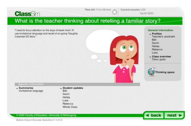
Figure 3: An example of a screen that allows the user to be aware of the teachers' thoughts