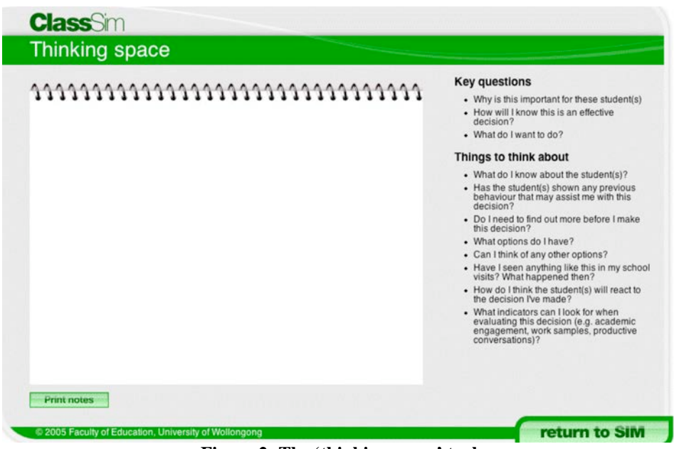
Figure 2: The 'thinking space' tool

The embedded 'thinking space' provides opportunities for the user to reflect on what has happened in the simulated classroom and plan, articulate and justify future decisions as they occur. This cognitive tool was developed to provide avenue for more formalised reflection. We found that pausing and reflecting was not a natural process for many of our pre-service teachers. Including a tool that was continually accessible, with prompting questions to think about, was one way to encourage articulation of thoughts, rationale for decisions and notes for future reference amongst our pre-service teachers. This tool is illustrated in Figure 2.