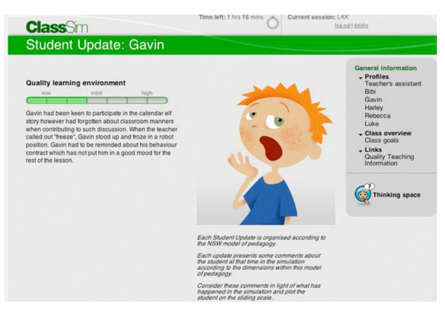
Figure 1: An example of a student update

In the introduction of new teaching and learning experiences the user is able to access 'teacher thoughts' pertaining specifically to what is happening in that episode. We believe this provides pre-service teachers with access to detailed commentary from someone on the field. Further, the ability to access commentary provided by an expert for individual targeted children at decisive points in the simulation provides additional access to expert advice. Figure 1 provides an example of such information. The user is able to see a rating of where on the continuum that particular child may be, along with a visual image representing what that child may look like at that time. We spent considerable time developing more than forty facial expressions for individual children within the virtual classroom. As teachers, we were very aware that often the first indication you get as to how engaged a student is, is from looking at their face. With that in mind, the development of a visual representation seemed appropriate to accompany the more descriptive written commentary.