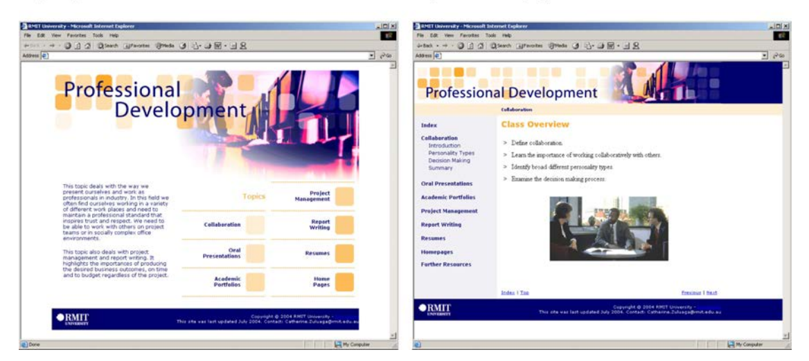
Figure 3: Example of topic splash screen and a content page

Since the topic should be able to sit within any course context it must be a truly independent learning object. On the server the topic will be a directory with a meaningful name relative to the title of the topic. Online each topic will open with a distinctly designed introductory screen that has the main purpose of identifying and describing the topic. This design is carried over into a banner for each subtopic (Figure 3) where it remains as a constant identifier. At this subtopic level the format is more formulaic allowing a template to be used, for easy editing and updating as required. Ideally each subtopic has an associated graphic to accompany its introduction and to provide visual stimulus.