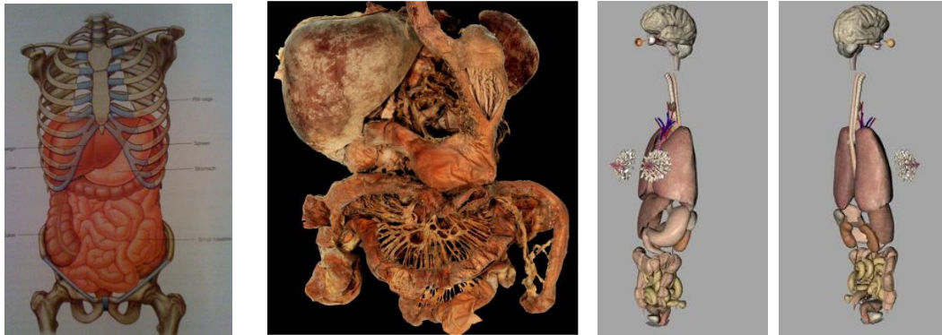
Figure 1: Image from textbook, image of cadaver, 3D images from haptic interactive system

Current learning of anatomy consists of 2D coloured images (i.e. textbooks), e-resources (similar with textbooks but interactivity is added on), and cadaver dissection. An expensive cadaver option may not be a best option for learning. In spite of its cost and the difficulty of providing multiple learning opportunities with it, there are still gaps between what we can learn from it and what we can apply to clinical situations. The first image is an example of an image in a textbook. The last two images are used by the new haptic interaction system. The 3D images are rotatable and zoomable with a haptic interface (See Figure 1 for examples).