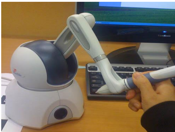
Figure 2: Phantom Omni robotic arm with ‘touch feedback’

In order to test user acceptance by human users in the subject area, two different interfaces will be implemented. One interface is to use a haptic device such as Phantom Omni (Figure 2) that provides different type of haptic feedback to the user depending on his selected activity. The other interface is to use the same system with commercially available game device, Xbox 360 Kinect. This will provide an interface with fingertip control (Figure 3), but without haptic feedback.