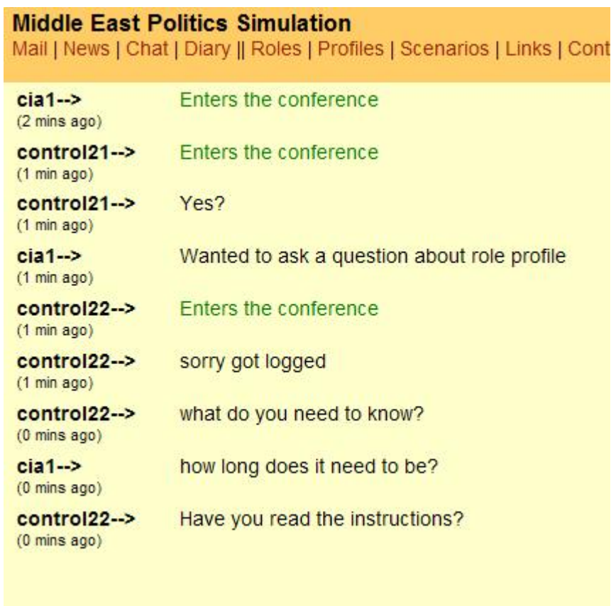
Figure 2: MEPS chat window showing broken session

There have also been some regular expressions of yearning to add Web 2.0 functions such as micro-blogging or Facebook-style updates and file sharing to the MEPS. Partially this stems from an assumption that students use these things in their private lives and therefore might expect their inclusion or that the availability of these things will make the MEPS more enjoyable for them. However, it increasingly needs to be considered that in a world where senior politicians and even terror groups make full use of the Internet to post their opinions or Tweet, such social media tools are now actually a legitimate aspect of simulating political discourse.