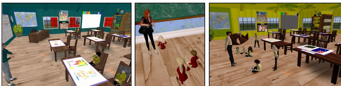
Figure 1: Pre-service teachers undertaking VirtualPREX role-play activities

to inform their role as the teacher. Peers, role-playing primary school students, were given their role during the workshop. These roles were designed drawing on the description of student behaviours that emerged during the focus group discussions. The role-plays that the students received were colour coded – pink/orange were “good” and blue/green were “naughty” students (see Table 1). This assisted in keeping the pre-service teacher on task as to which role to play and to easily swap if needed.