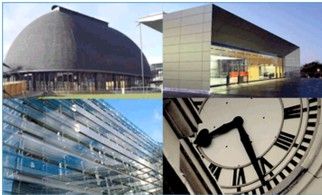
Owen G Glenn Building, The University of Auckland