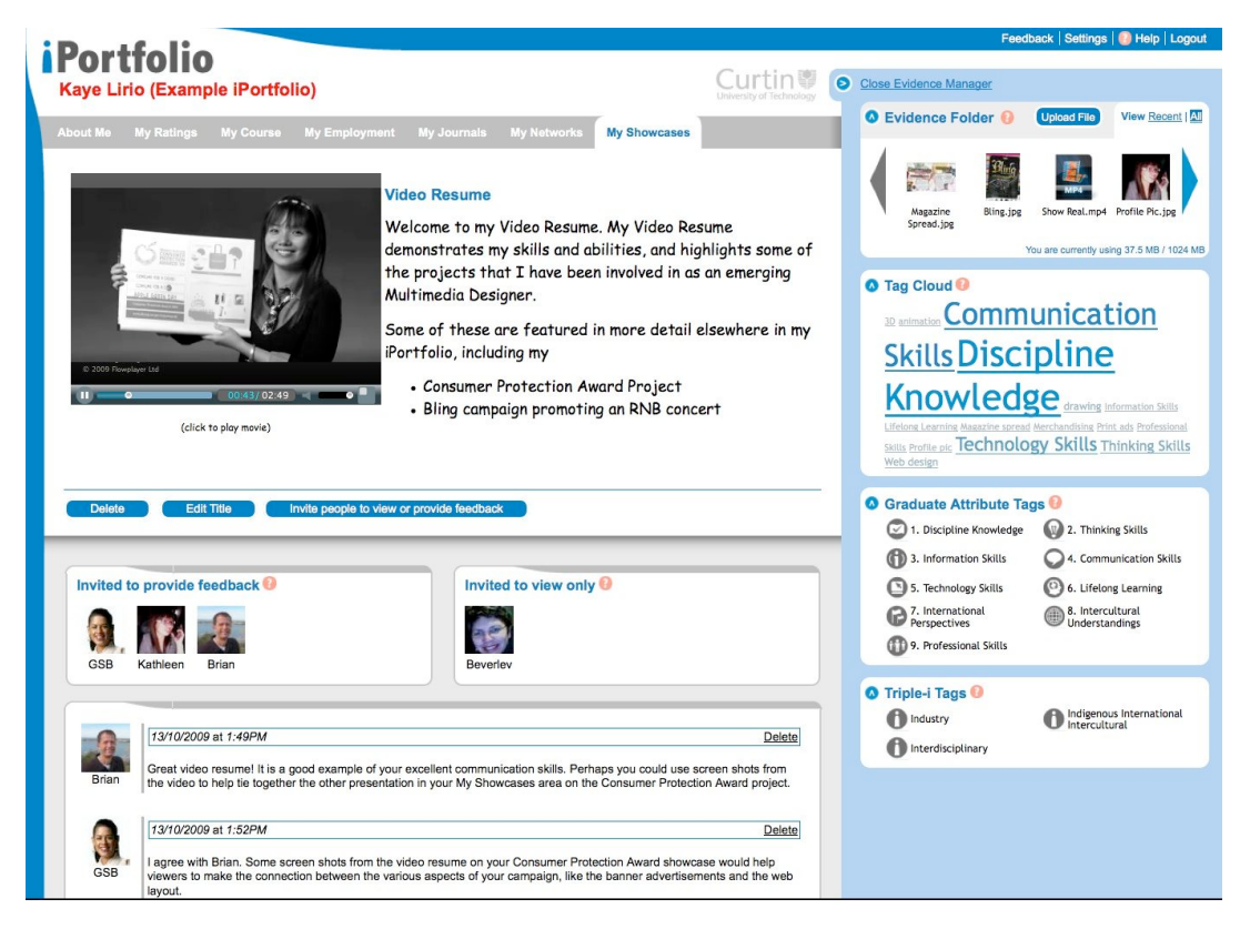
Figure 2: An example iPortfolio entry containing a video resume with feedback from others