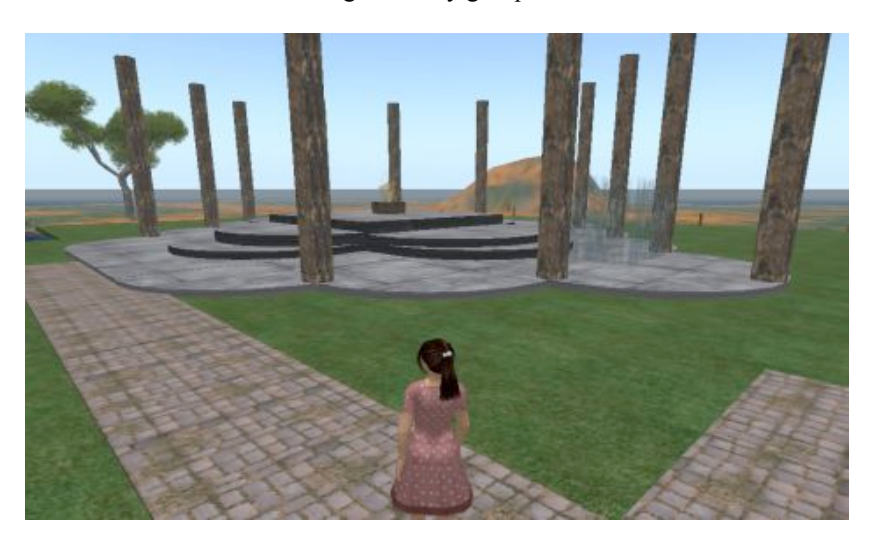
Figure 1: Forum space on Australis-4-Learning

Within Second Life the study used an island identified as Australis-4-Learning, which is the site of a joint project between the Australian Catholic University, Curtin University and the University of New England. The island was designed, within our area, to provide places for group discussion as well as a replica of a classroom learning experience using a neo-Likert scale, with the building of the space being undertaken by the author / researcher. Images of these spaces are below. Figure 1 shows a forum area where students could meet to share ideas and discuss topics. This was used as a space where instruction could be given to a large group before students could move to complete the task. Figure 2 shows the neo-Likert scale area, a space where students were able to move to these signs and by clicking on them they could sit on top to form a group discussion. These signs were positioned so where students were able to hear and interact with conversations occurring at nearby groups.