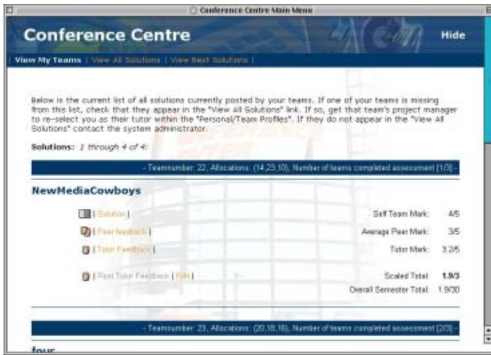
Figure 2: Marks assigned by tutor, peers and self, are visible to all

Comments received included: “We were unhappy with the mark we received until we reviewed team X’s assignment and realised where we went wrong”; or “having reviewed team A and B we realised that our cost projections were quite weak and needed to be changed”.