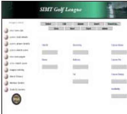
Figure 4: Administrator Menu