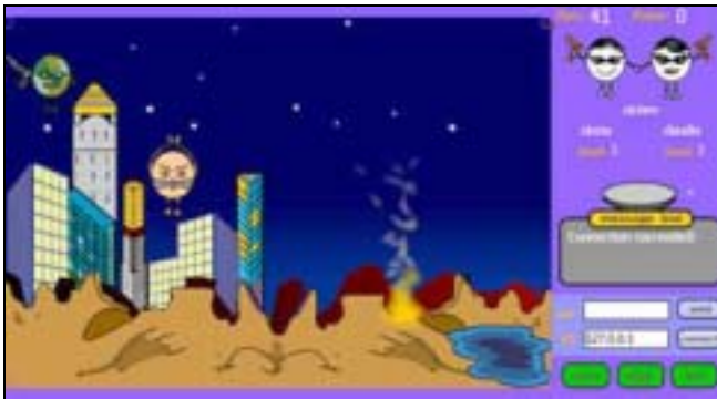
Figure 1: Mickey & Mallory

The following screen shots (Figures 1 and 2) are taken from some of the games developed during the course. There were various genres represented, including quiz/trivia games, puzzles and adventures, reflex and target-practise, team games and simple strategy games.