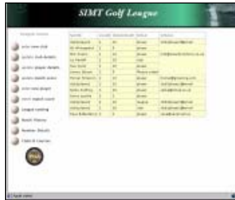
Figure 5: League Members