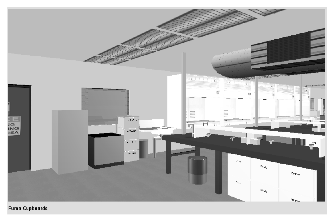
Figure 1. The Virtual Chemistry Laboratory used in Study 1 by the User Control Group This shows a view after clicking on the fume cupboards

The version of the virtual laboratory used by the user control group contained a text area and a virtual environment area. Participants were able to move through the environment and look to the left or right by using the arrow keys. If they clicked on a cupboard door or a draw, it opened and their viewpoint was adjusted so that they could see into it. It would then shut when they clicked on it again. If they clicked on an item of apparatus the name of the item was displayed in the text area. If they double-clicked on an item of apparatus the item would move up close so that it could be inspected. If the object was clicked while being inspected, it would automatically rotate left-right and if clicked again it would rotate up-down. They could then put the item back down by double-clicking on it again. See figure 1 for a screen shot showing the virtual laboratory.