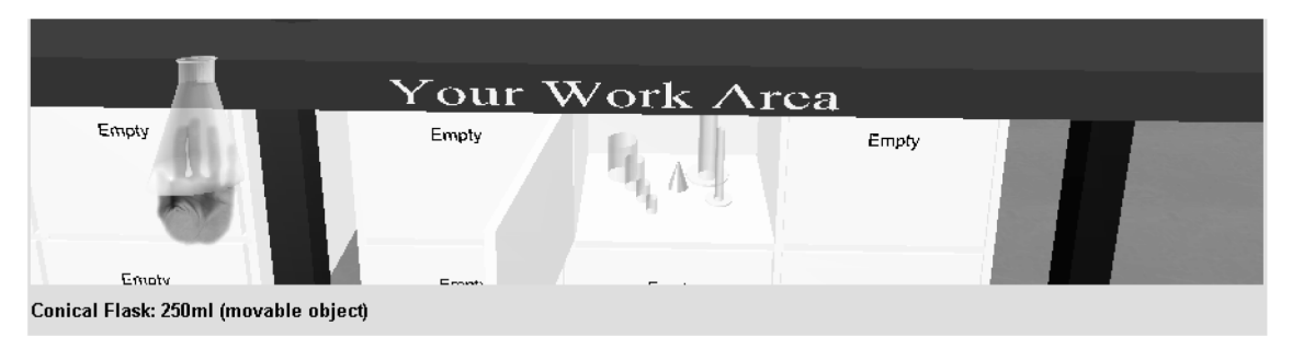
Figure 3. The Virtual Chemistry Laboratory used in Study 2 by the User Control Group This shows a part of the screen only, after picking up a conical flask

The virtual environment used in this study was very similar to the environment used in the first study. The main enhancements were some minor improvements to the interface used for moving and looking around the environment and the addition of tools allowing the user to pick up, carry and place objects. See figure 3 for a screen shot showing the new interface.