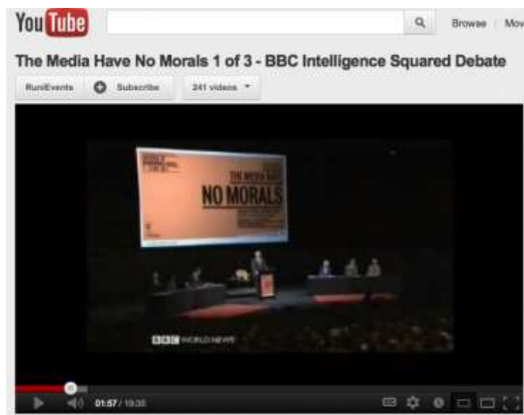
Figure 2: Sample of a video that can trigger the enquiry process.

At the start, students require triggers to initiate their enquiry process. Most commonly in communities of enquiry these triggers are questions, issues or problems identified by the teacher and/or students for further investigation and research (Arbaugh, 2007). Triggers vary according to the disciplines and the topics being explored. They may include video stimulus, core texts from the literature and/or case studies or experiments. A video case study can be a successful trigger because it provides a common example that the students can discuss in relation to the further academic research that they pursue. The video can introduce some controversy or an issue that requires an argued response from the students and provoke their enquiry process. The video in Figure 1 requires a critical response from students based on an understanding and application of the literature relating to ethics and the media (YouTube, 2011).