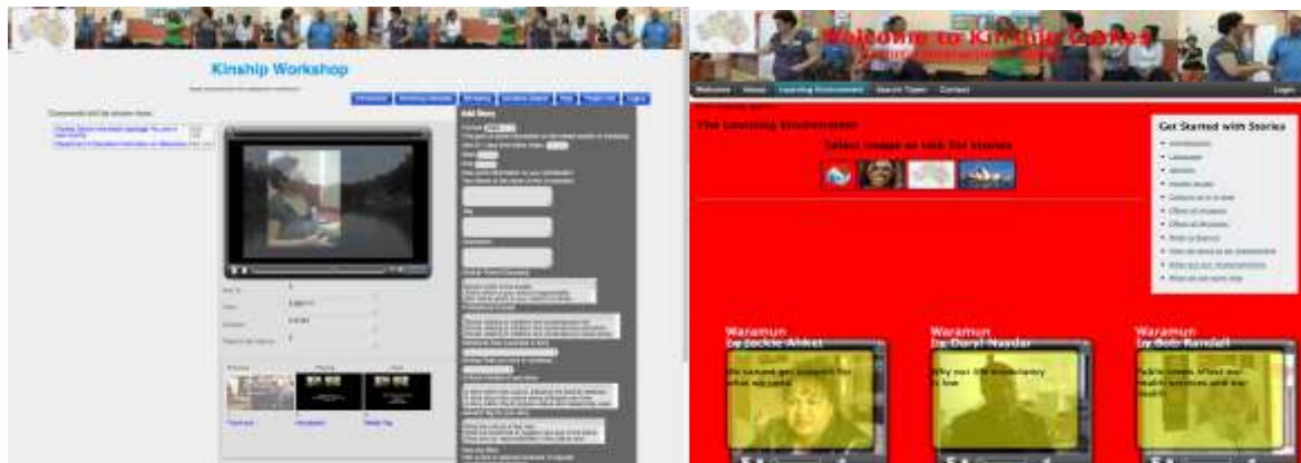
Figure 1a Introduction with comments and panel to upload narratives 1b Narrative browser

The learning system is designed to reflect where possible Aboriginal knowledge sharing processes. This is traditionally through interwoven stories, song and dance at a community ceremony or corroboree (Langton, 1997). These ceremonies or performances provide for re-enactment and are an environment for experiential learning of the subject matter. While web services provide a form of mediation that is representational and more static than previous methods of knowledge sharing (Verran & Christie, 2007), this medium does provide for greater user adaption and generation of material by many distantly located authors.