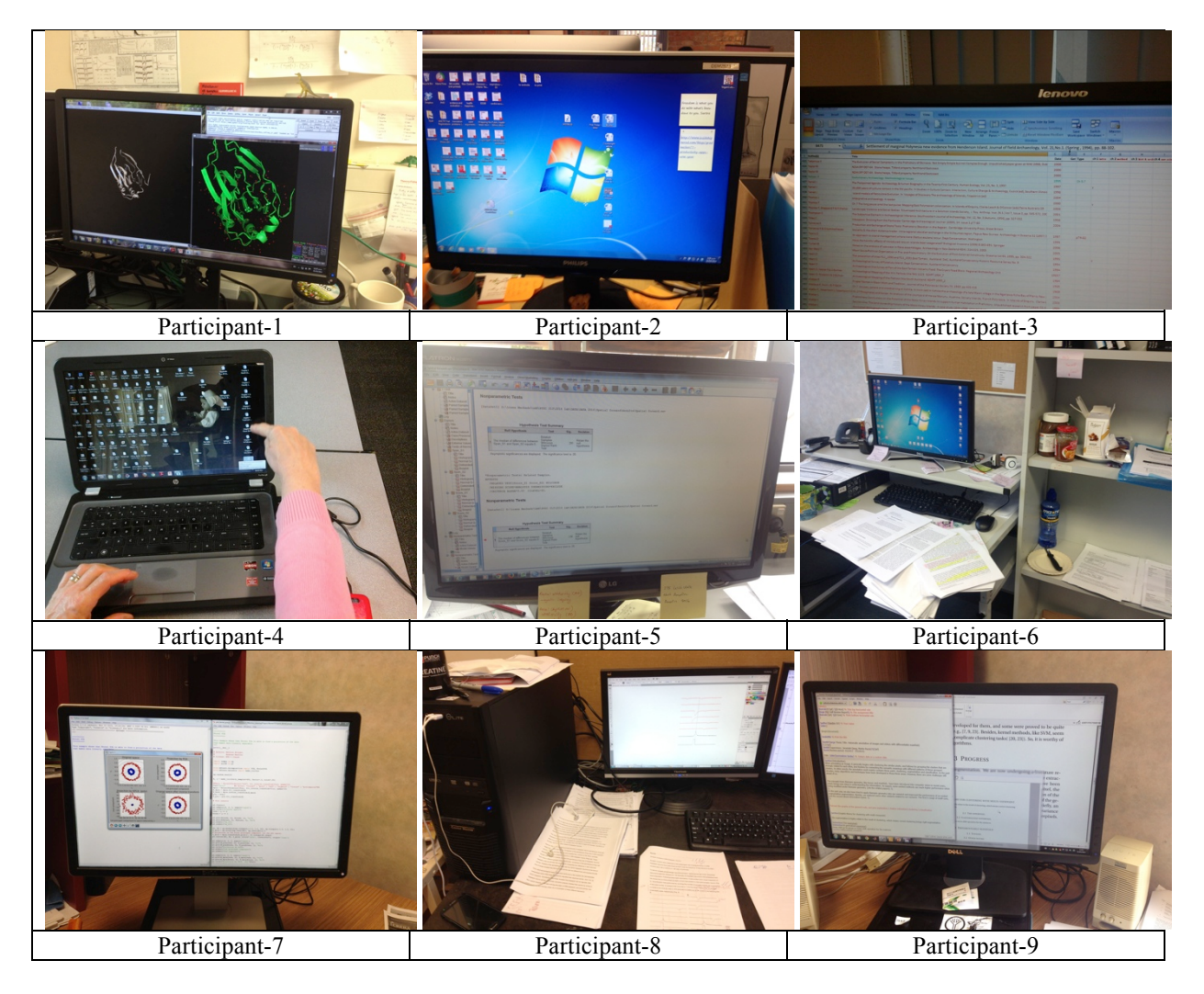
Figure 2: Photographic capture of the participants' ways of using ICT